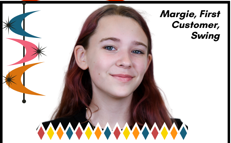
Margie, First Customer, Swing