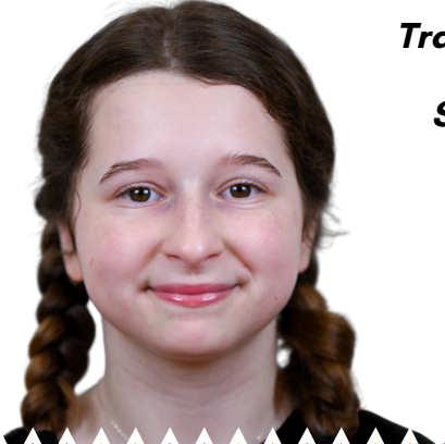
Trainman, Parent, Sullivan Show Crew