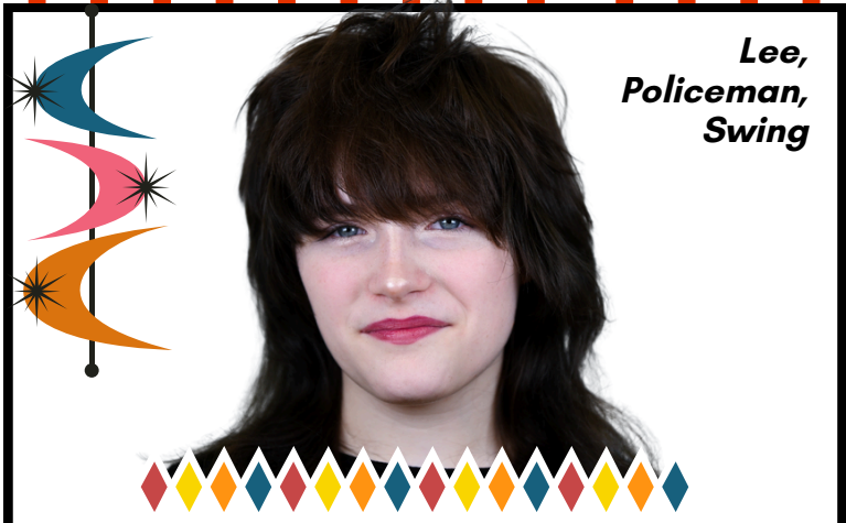
Lee, Policeman, Swing